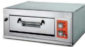
Single Deck Oven