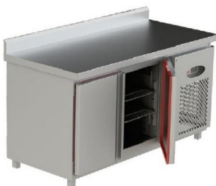
Under Counter Chiller