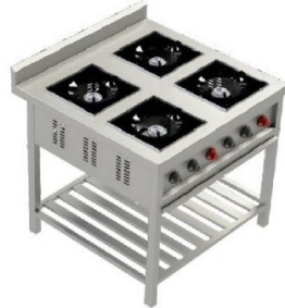
4 Burner Stand