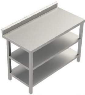
Table Under 2 Shelves