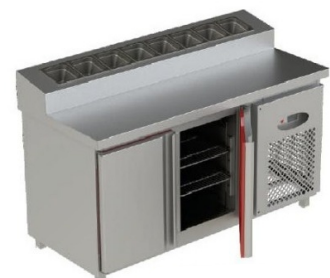
Cold Prep Table