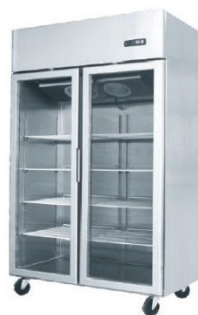
Glass Door Chiller