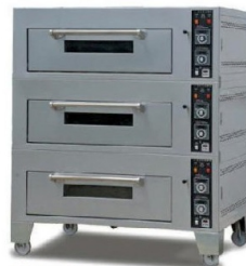
Triple Deck Oven