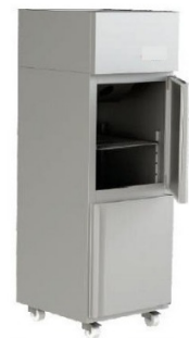
Single Door Chiller