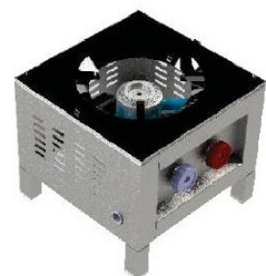
Stock Pot Burner