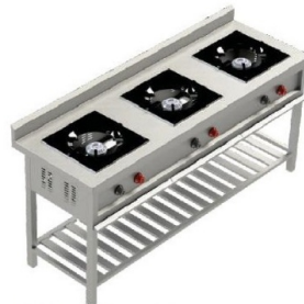
3 Burner Stand