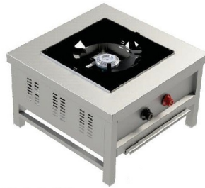
Stock Pot Burner