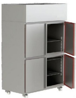
4 Door Chiller