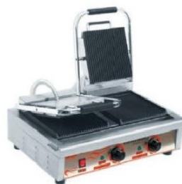
Panini Grill Double