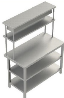
Table with Gantry