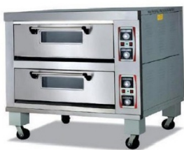
Double Deck Oven