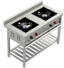
2 Burner Stand