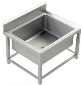
Tub Type Sink