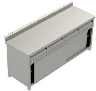
Table Under Cabinet